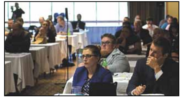
Record attendance at LP West Virginia convention