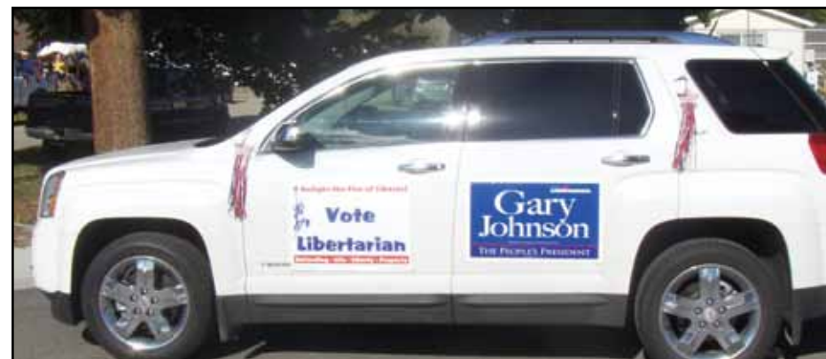
One of LP Montana’s parade contingent vehicles

Montana is working on getting to a few fairs this summer, including Gallatin County Fair, the Western Montana Fair, and the Ravalli County Fair. It would be nice to get up north to Kalispell and over to Billings, if time and money permit. Our legislative candidates are working to hit the ground running after the June 7 primary.