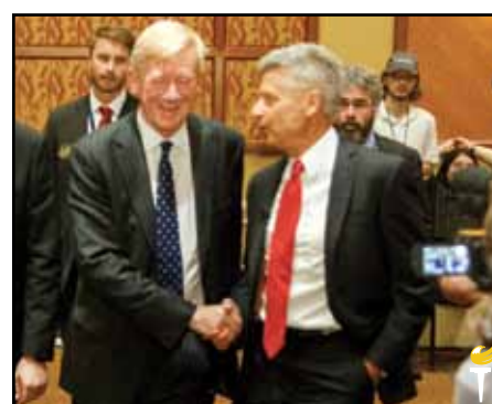
Governors William Weld, Gary Johnson

up for the 2012 convention, this year the party fielded requests for more than 270 press passes. The country's largest media outlets were there, including CNN, ABC, NBC, CBS, Fox News, Reuters, Associated Press, the New York Times , the Los Angeles Times , the Washington Post , One America News Network, and C-SPAN, plus a half-dozen international outlets.