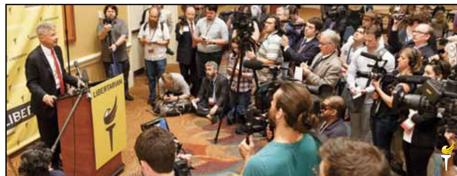
Gov. Gary Johnson fielding questions at a press conference during the convention