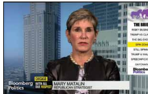
Political strategist Mary Matalin on Bloomberg TV

Matalin, a strategist who has worked for the 1984 Reagan-Bush campaign, as George H.W. Bush's campaign director, as assistant to George W. Bush, and as assistant and counselor to former vice president Dick Cheney, exited the Republican Party in May.