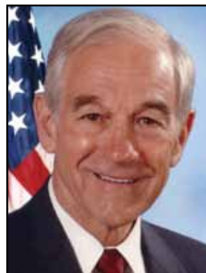
Rep. Ron Paul, M.D.

Almost unheard of in the halls of Congress, Paul has unapologetically advocated ending the federal income tax, balancing the budget, removing or reducing scores of unneeded federal government agencies, auditing or eliminating the Federal Reserve, and drawing down the U.S. military.