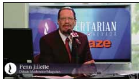
Penn Jillette hosting LP Nevada's presidential debate for TheBlaze; Las Vegas